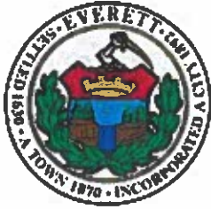
Robert J. Van Campen MAYOR

CITY OF EVERETT - OFFICE OF THE MAYOR 484 Broadway Everett, Massachusetts 02149