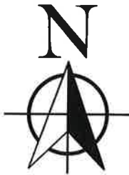
EXHIBIT A – NOT TO SCALE

The exact location of said Facilities to be established by and upon the installation and erection of the Facilities thereof.