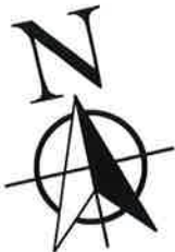
EXHIBIT A – NOT TO SCALE

The exact location of said Facilities to be established by and upon the installation and erection of the Facilities thereof.